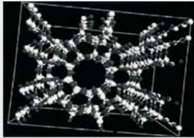
Bentonite - Montmorillonite